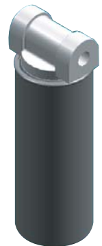
260BHG w/50003 Adaptor