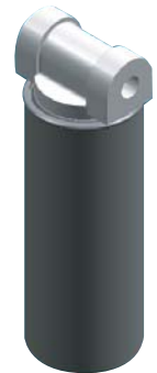
260BMG w/50003 Adaptor