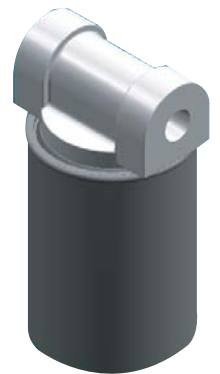
300HS w/50003 Adaptor