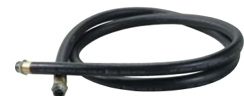
8' (2.4m) Discharge Hose (for LP Kit Pumps only) Part # HA08034