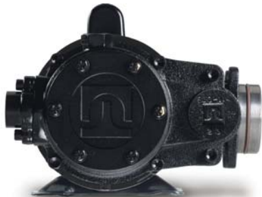
Shown with side-mount flange

The Fill-Rite LP Series pumps are available in a variety of models for virtually any lube transfer pump need.