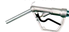
Nozzle (for LP Kit Pumps only) Part # 6U075