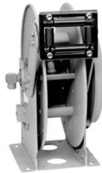
Shown with Optional TR Roller Position