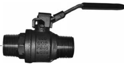
Fig. 633...straight style

Fig. 699F ...male threaded inlet—female threaded outlet—faucet style