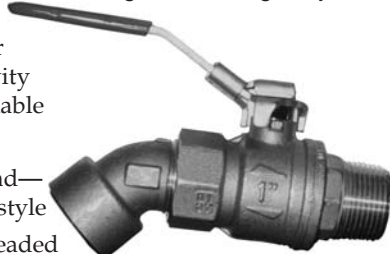
Fig. 699F...faucet style