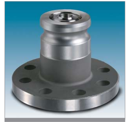
1673ANF and 1673ANFT